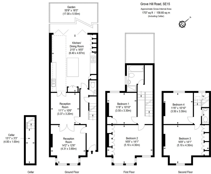
ILLUSTRATION FOR IDENTIFICATION PURPOSES ONLY

ALL MEASUREMENTS ARE MAXIMUM AND INCLUDE WINDOW BAYS AND WARDROBES WHERE APPLICABLE THIS PLAN MUST NOT BE REPRODUCED BY ANY OTHER PERSON WITHOUT PERMISSION